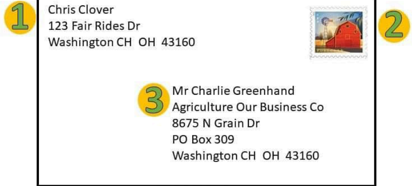
Front of Envelope