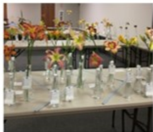
Fayette County Master Gardeners Daylily Show Entries

The Fayette County Master Gardeners also play a pivotal role with community education. Through various partnerships, including the Fayette County YMCA, the Master Gardeners teach gardening classes and aid in starting learning gardens around the community.