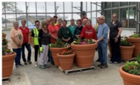
Fayette County Master Gardener Volunteers

The Master Gardener Volunteer program provides intensive training in horticulture to interested Ohio residents who then volunteer their time assisting with educational programs and activities for the community.