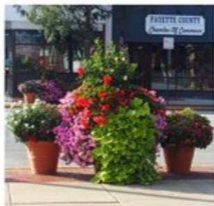
Sponsor A Pot Flowerpots